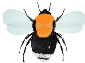
Tree bumblebee* Can sometimes be all black