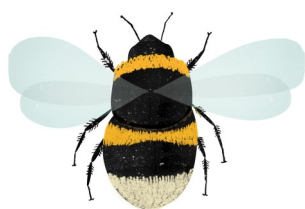
Buff tailed bumblebee