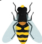
Hoverfly Hovering flight, no sting!