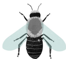
Ashy mining bee* Makes its nest underground