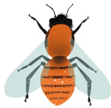
Tawny mining bee* (Males are smaller and browner)