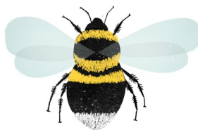
Garden bumblebee Has a long tongue