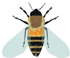
Honeybee Carries yellow pollen on its legs