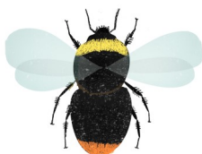
Early bumblebee (Males have yellow facial hair)