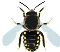
Wool carder bee collect fibres from plants