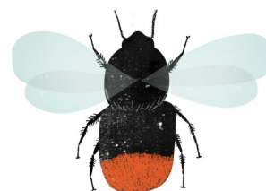
Red tailed bumblebee* (Males have yellow facial hair)

Spend an hour in your garden or local green space and tell us what you find! We'll use this information to build a picture of what we have in our town.