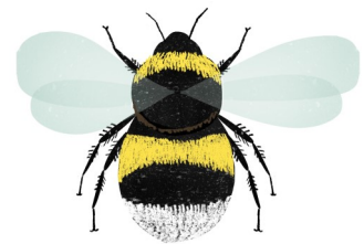
White tailed bumblebee (Males have yellow facial hair)