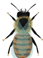
Red mason bee* Makes holes in mortar