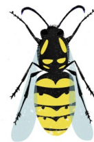
Social wasp Chew wood to make paper nests

BUZZ-IN BORO is a project to increase and encourage bees and pollinating insects in Middlesbrough. This includes workshops, guides and changes to how our greenspaces are managed to improve biodiversity. To find out more, visit: www.middlesbrough.gov.uk/buzzboro