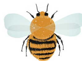
Common carder bumblebee (Male has facial hair)