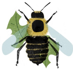
Willughby's leafcutter bee cuts perfect circles in leaves