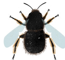
Hairy footed flower bee (Males are lighter in colour)